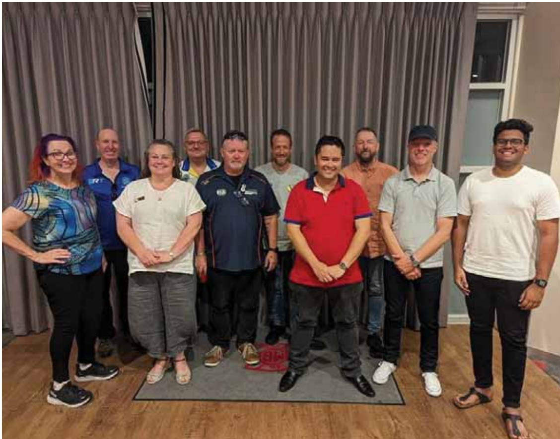
Congratulations to all those recently elected/appointed to the 2024 VFT Committee!