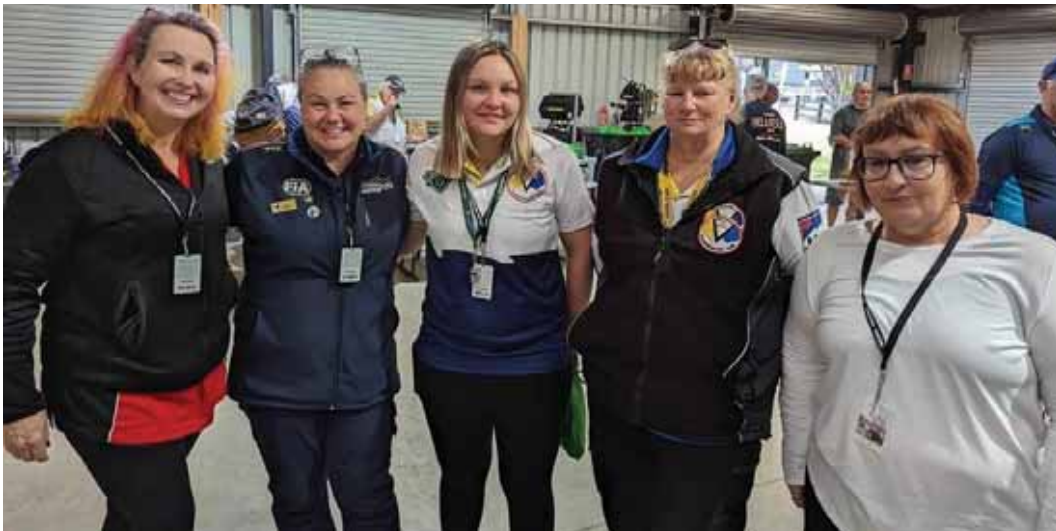
Celebrating our female officials on International Womens Day on Friday 8-March at Phillip Island