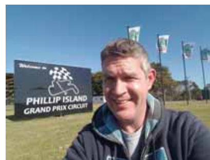
(I think this photo says it all - after my first event as a flag marshal Island Magic 2021)