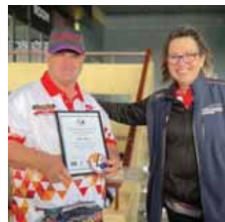
Presentation of service awards