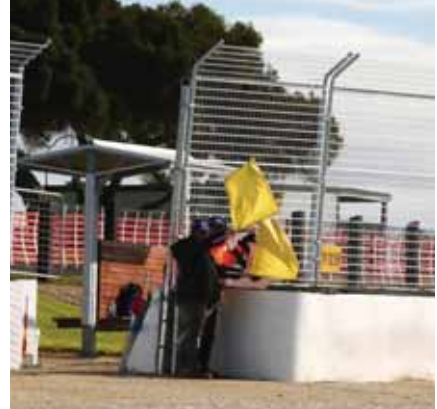
VSCRC Rd 4 - Sandown