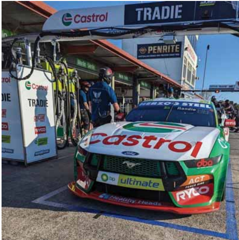
Supercar of Thomas Randle who recently took part in the VFT online training session