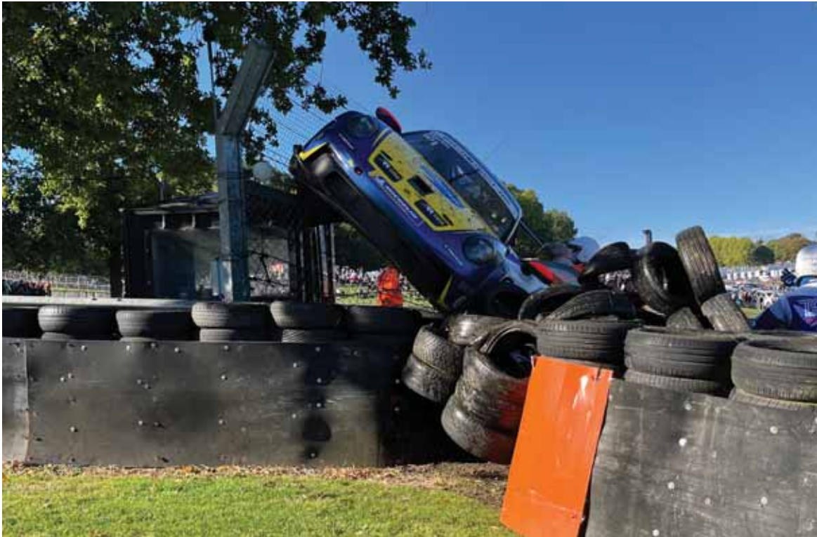
Strange place for advertising Porsche and Michelin! Pictured at Brands Hatch, UK. Fortunately both marshal at post and driver were uninjured.