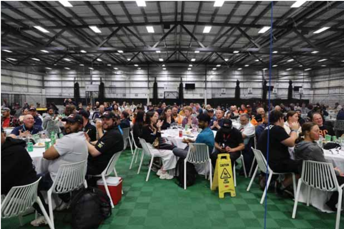
VSCRC Rd 2 Winton