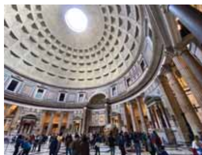
Pantheon interior – the oculus is nearly nine metres across