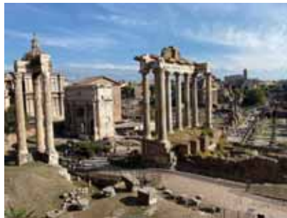
2000 year old Roman Forum