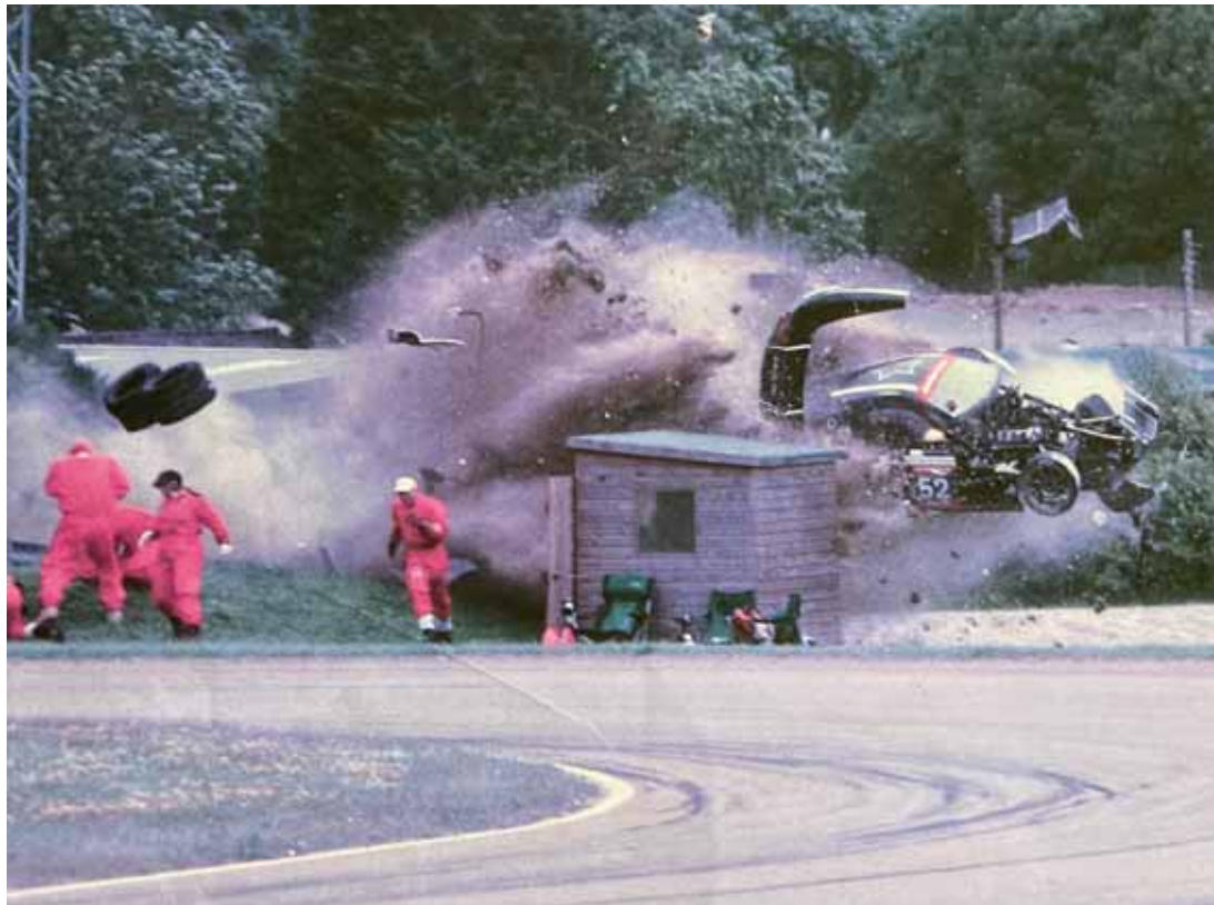
They do say motor racing is dangerous! One thing marshals need to learn is how to run – fast!!