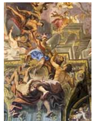
Church of Sant'Ignazio Fresco