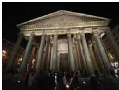
Pantheon – and no sign of it falling down after 2000 years!

Perhaps the highlight of our new (to us) discoveries was the Basilica San Clemente. It's easy to find, not too far from the Colosseum. At street level stands the current 12th century church which contains lovely frescos and mosaic work. The ceiling is Baroque, redone a mere 400 years ago. About 150 years ago someone did some excavation, and discovered the original church of San Clemente, which dates from about 400AD, directly underneath. More beautiful frescos that are well over a thousand years old. But wait, there's more! Underneath the 1600 year old church is a 2000 year old Roman villa, complete with spring, and a temple to the god Mithras. It's a triple layer cake of history and it's all available to enjoy.