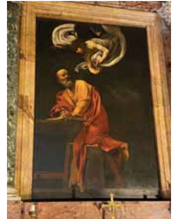
Moses by Caravaggio