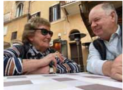
Waiting for coffee in Piazza della Rotondo!