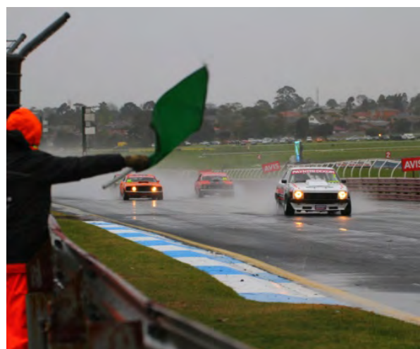
Another perfect day??