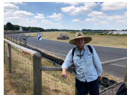
Man with poor taste in hats seen loitering