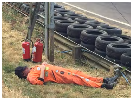
The marshals were alert and focussed at all times

Recently while on holiday in England I went to Castle Combe race track with my brother-in-law Jim. It was a nice sunny day, and I was having withdrawal symptoms from not being trackside. In fact, it was 27 degrees, a temperature described by the BBC as "searing heat." The Castle Combe track is a rather flat circuit being roughly based on the perimeter road of an old WW2 airfield, it's just under three kilometres around. Unlike Sandown, which surrounds a horse race track, or the island circuit, which encloses a wildlife haven for geese and wallabies; here they have a paddock in the middle, half of which is cornfield, and the other half has solar panels.