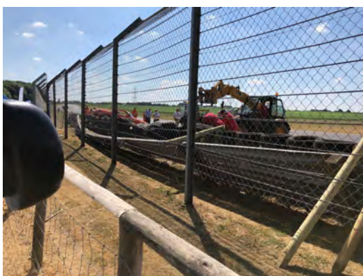
Bent fence with culbrit on top

The racing was good, but considerable time was spent mending walls. I put this down to effect of extreme heat on the drivers. There was a good turnout of Formula Fords, and their races were predictably interesting. There was a race for Mazda MX5s, the field was big, and the racing was fantastic, except when they tried to knock down walls! The Porsche race (mostly Boxters) was not bad, but the touring cars were disappointing. They started with a field of eight, two managed to hit a wall, then there were only six etc etc.