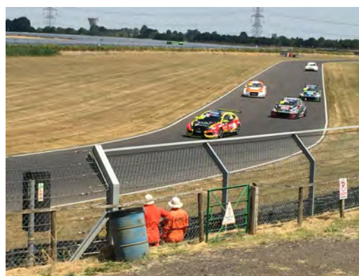
These marshals don't!