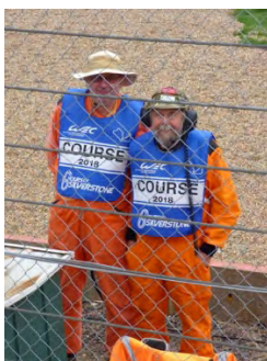
Hon Pres trackside at the WEC 6 hr at Silverstone (L & R) and the Goodwood Revival (below)