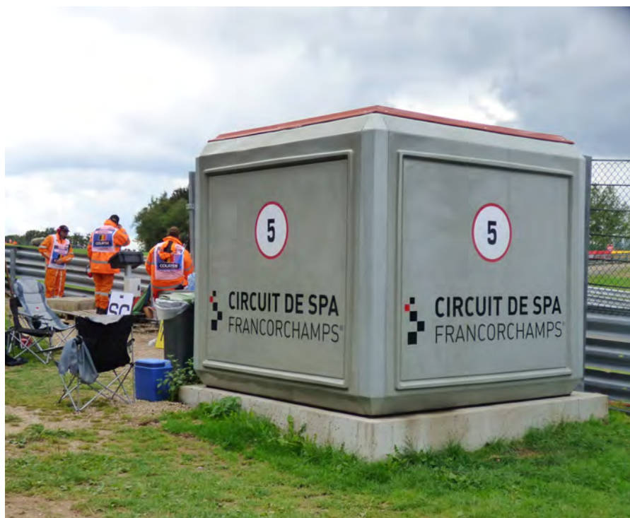
A Marshal Post at the Belgian Grand Prix at Spa