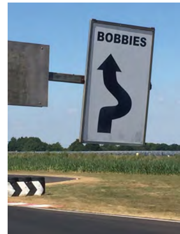
Right, then left, then straight ahead

Anyway, it was a fun day trackside, with the bonus of watching the English folk quietly sizzling in the sun. They don't expect to see it for another year, so they take off as many clothes as they can. I reckon the sunburn the next morning could have been measured by acres rather than square inches! A good time was had by all.