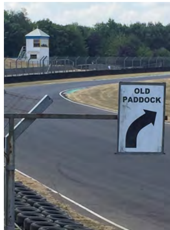
The next corner goes right!

Another difference I couldn't help noticing was that before each corner or chicane there was a sign telling the drivers whether the turn was to the left or right. This must be a boon for drivers who have short-term memory problems, who having been there about ninety seconds ago, may have forgotten which way the circuit actually goes! I observed that even with this level of assistance a number of drivers chose to turn left instead of right, or vice versa. This sometimes resulted in cars hitting walls etc etc. I put it down to the heat.