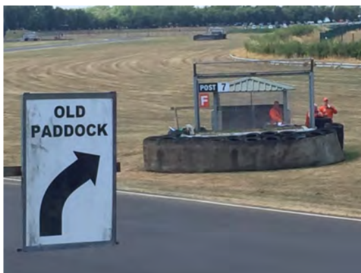
These marshals have weather protection