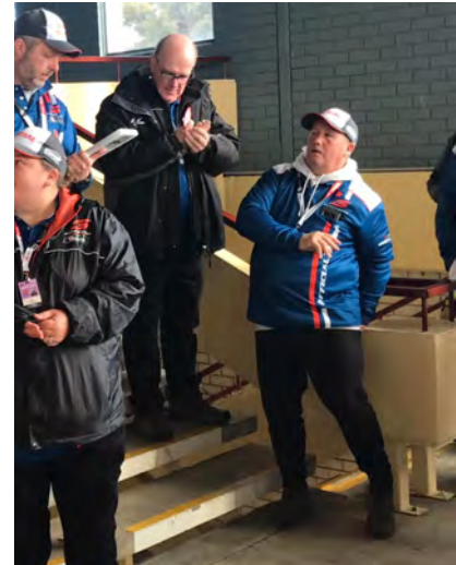
What's this guy doing??!!