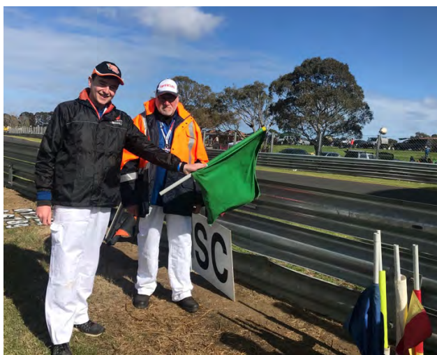
A new Young Official