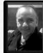
Murray Stevens Promotions