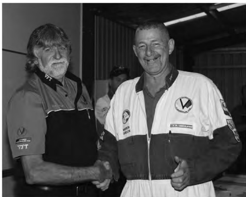
Service awards presentation at Island Magic Briefing