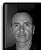
Murray Stevens Promotions