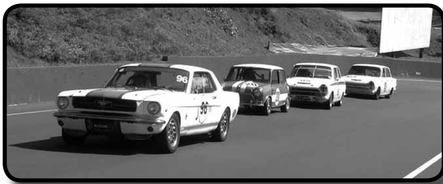
"As It Should Be"

These Guys and Gals really do look after us!!