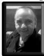
Murray Stevens Promotions