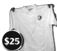
Polo shirt New colour: White