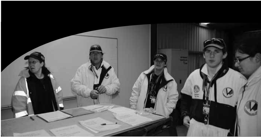
VSCRC Round 4 Phillip Island