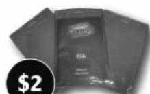
3 plastic pouches