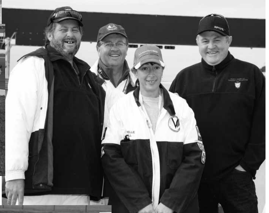
Shannons Nationals Phillip Island