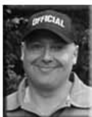
Grade 4 Rep