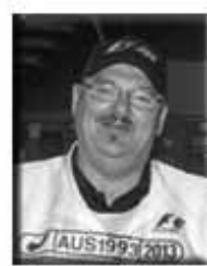
Grade 3 Rep