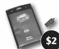
plastic pouch and whistle