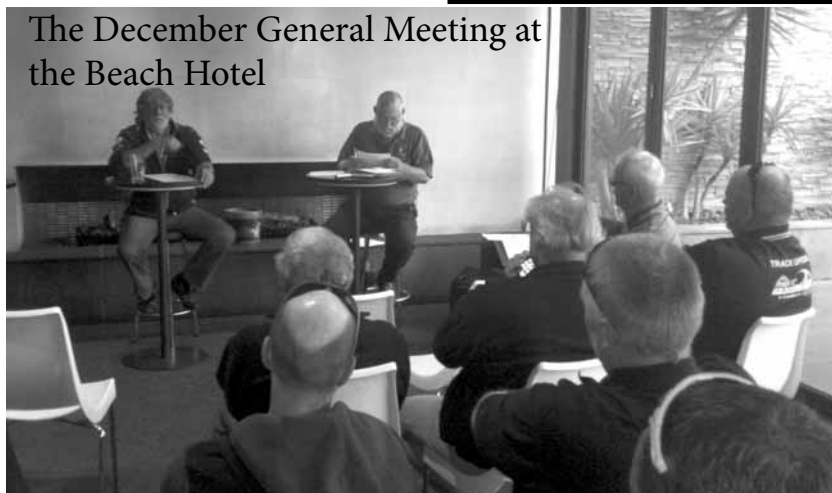
The December General Meeting at the Beach Hotel

By the time the magazine is out, the nominations for the 6 elected Committee positions will have closed, all other positions on Committee page of magazine are open. EOI's to be forwarded to Secretary before the 20th February 2013 Committee meeting.