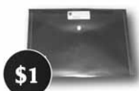
A4 plastic wallet