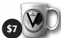
20 year coffee mug