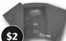
3 plastic pouches