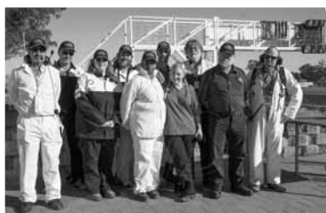
Winton V8 Supercars